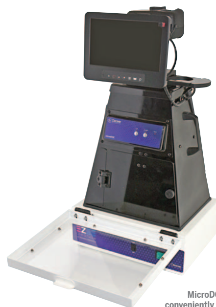
MicroDOC sits conveniently on the small UV Transilluminator